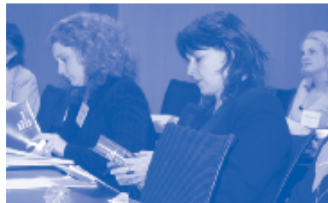
Walk team captains listened intently at an informational meeting on the 2008 NAMIWalks.