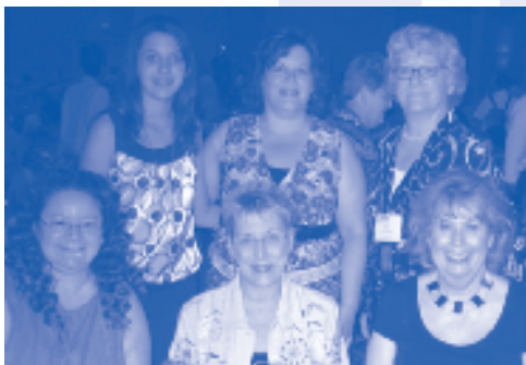
NAMI Minnesota staff and others gathered at the national NAMI convention in Orlando, FL this June.

A few other highlights include: - Funds for collaboratives who lost federal funds